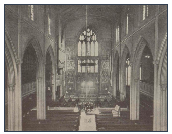
St Andrew's in Wells Street.